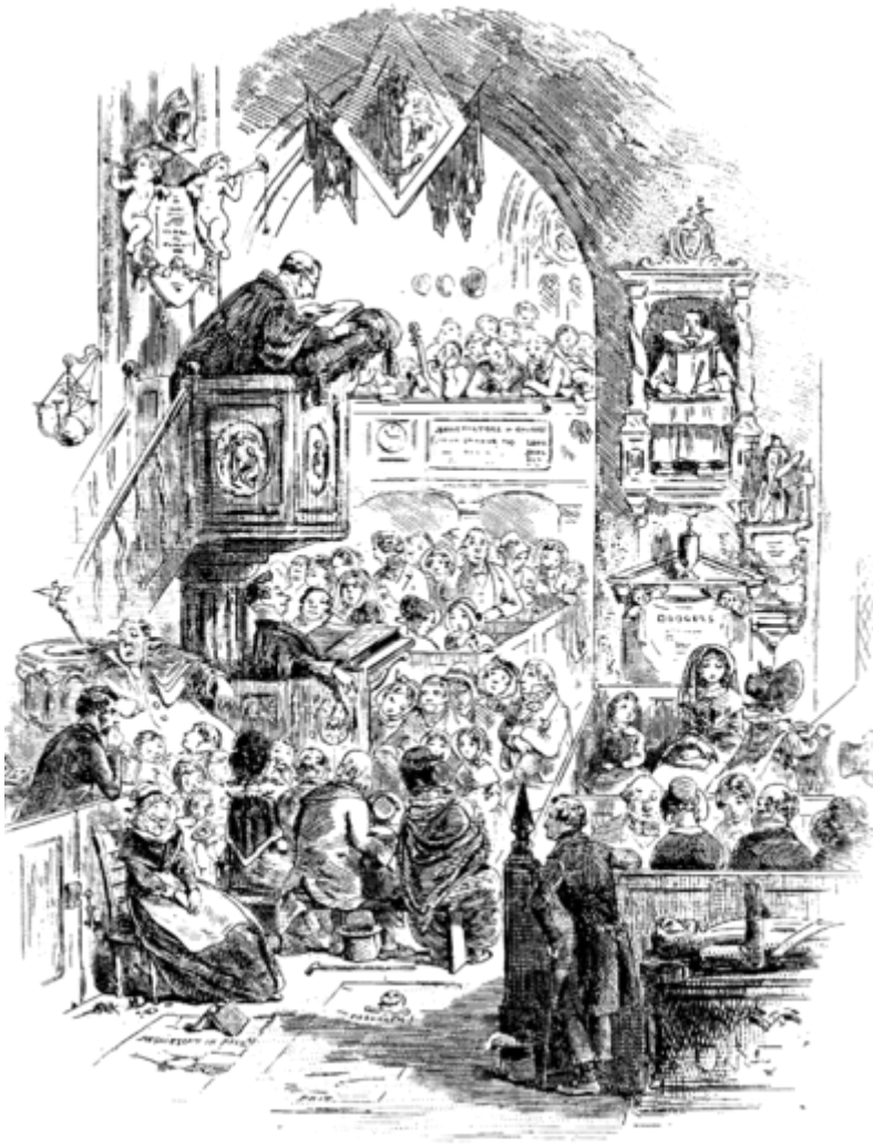
Our Pew at Church

Here is a long passage—what an enormous perspective I make of it!—leading from Peggotty's kitchen to the front-door. A dark store-room opens out of it, and that is a place to be run past at night; for I don't know what may be among those tubs and jars and old tea-chests, when there is nobody in there with a dimly-burning light, letting a mouldy air come out at the door, in which there is the smell of soap, pickles, pepper, candles, and coffee, all at one whiff. Then there are the two parlors: the parlor in which we sit of an evening, my mother and I and Peggotty—for Peggotty is quite our companion, when her work is done and we are alone—and the best parlor where we sit on a Sunday; grandly, but not so comfortably. There is something of a doleful air about that room to me, for Peggotty has told me—I don't know when, but apparently ages go—about my father's funeral, and the company having their black cloaks put on. One Sunday night my mother reads to Peggotty and me in there, how Lazarus was raised up from the dead. And I am so frightened that they are afterwards obliged to take me out of bed, and shew me the quiet churchyard out of the bedroom window, with the dead all lying in their graves at rest, below the solemn moon.