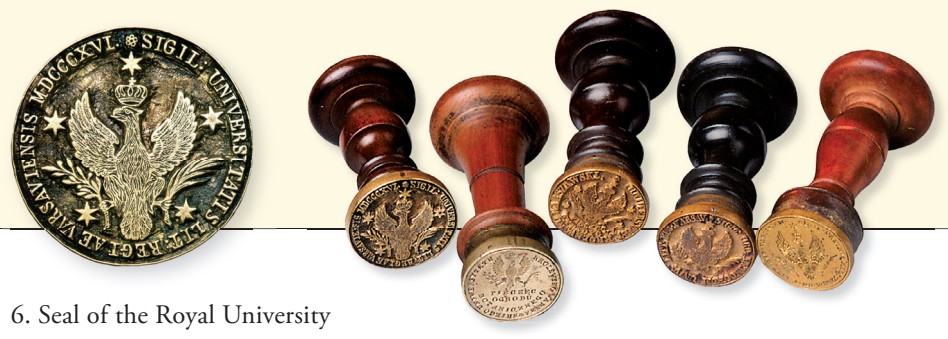
Seal of the Royal University of Warsaw, in use until 1823, MUW