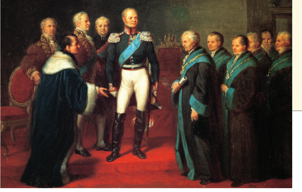
4. Anonymous artist, The Founding of the Faculty of Science and Fine Art at the University of Warsaw , oil on canvas, c. 1830, MNW